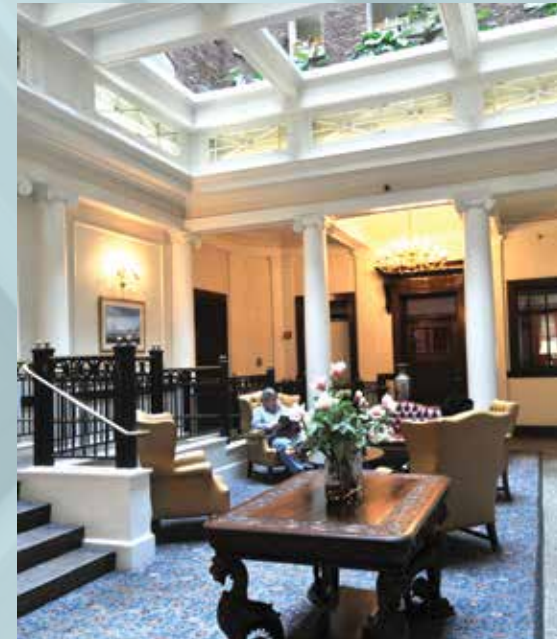
Beacon House lobby