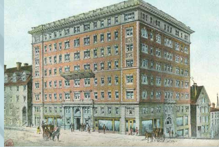
Beacon Chambers Hotel, 1901

One of Rogerson's great accomplishments of 2014 was the purchase of Beacon House. Rogerson had been a general partner in the ownership of Beacon House since 1982 when we restored the building after a fire and created affordable housing for low-income elders in a neighborhood that has priced out nearly all but the wealthy. By purchasing the property, Rogerson saved it from being developed as market rate units and preserved its affordability in perpetuity. All of this was only possible with a great deal of support from both Rogerson's Board of Directors and the Beacon House Corporation along with many State and City leaders, especially Boston Mayor Martin J. Walsh, and with community support.