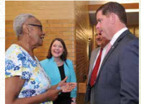
Mayor Martin J. Walsh visited Rogerson's Roslindale site where he met residents, toured the adult day health program and Fitness First, and visited the dementia day program.