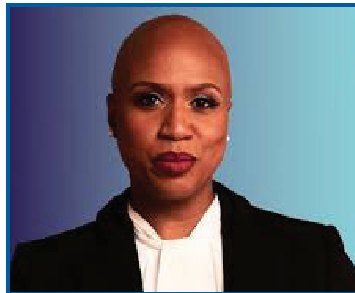
Congresswoman Ayanna Pressley was among the many public officials and leaders who have praised Rogerson's response to COVID-19 and thanked the frontline workers for their commitment to keeping seniors safe.

Residents, participants, family members, and staff have joined the ranks of local leaders in praising Rogerson's frontline workers for their incredible response to the pandemic.