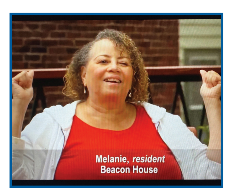
Residents, participants, family members, and staff have joined the ranks of local leaders in praising Rogerson's frontline workers for their incredible response to the pandemic.

"For 160 years Rogerson has been at the leading edge at the fight for housing as a human right - working to assure our elders and low-income families in and around Boston have the housing and services they deserve. In the face of the COVID-19 crisis Rogerson's properties for older adults, like so many of us, faced impressive new challenges. They found themselves at the early epicenter of the pandemic which has disproportionately impacted seniors and communities of color. The care, compassion and experience of the frontline workers who comprise Rogerson's staff, and risk their own well-being for that of the residents, have helped keep seniors safe and healthy. Let us take a moment to celebrate these workers who are and have always been essential. I'm so grateful for the work they all do every day for some of our most vulnerable neighbors in Massachusetts."