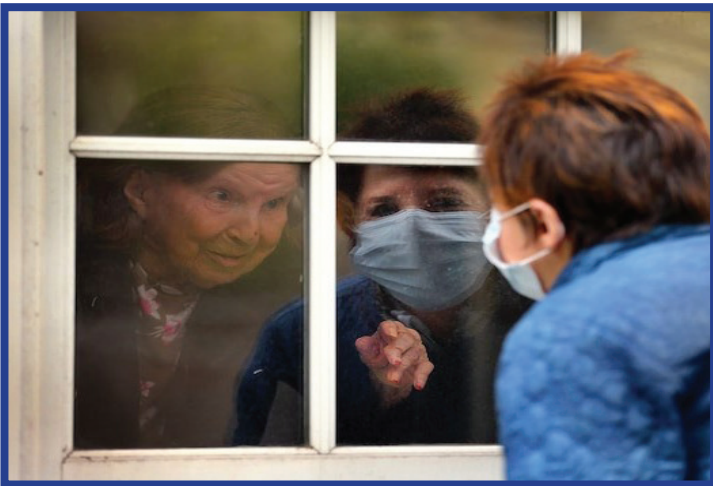
Rogerson House was featured in The Boston Globe, Photos: Mother's Day from a Social Distance.

Philanthropic support has long been the critical foundation on which Rogerson has built our legacy of caring for seniors. Rogerson depends on the generosity of donors like you to bring security and safety to the lives of Greater Boston’s most vulnerable seniors. With your commitment over the years, Rogerson assists more than 1,800 individuals