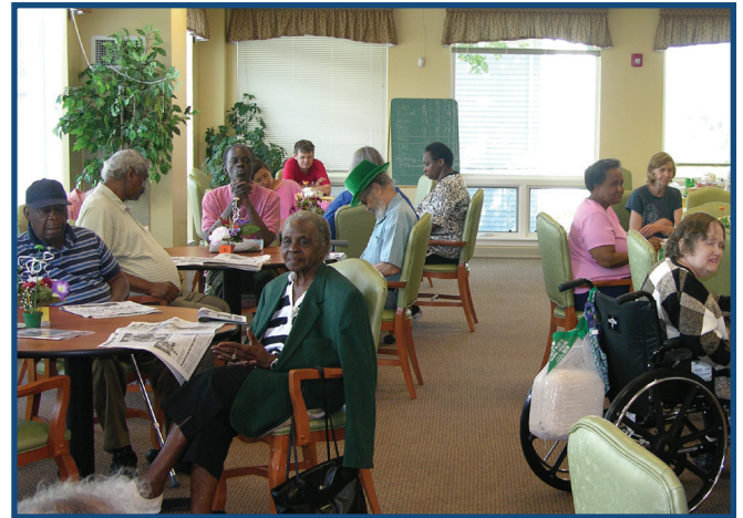
Rogerson's Egleston Adult Day Health Program in Roxbury welcomes displaced elders.

Our commitment to helping all elders age with dignity in their community has never prevented Rogerson from providing state-of-the-art services in the face of no reimbursement.