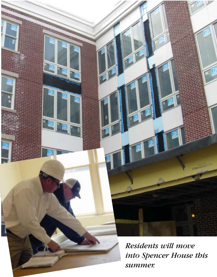
Residents will move into Spencer House this summer.

Supportive services will also be available on site and include Rogerson's state-of-the-art strength training program and an adult day health program which will serve approximately 50 neighborhood and resident elders daily.